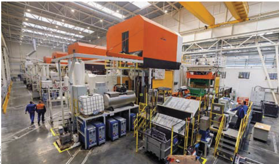
In Nemak's Slovakian foundry, the die casting machines are equipped with a KMA smoke extraction hood and a filtration system

At Nemak, the highly purified air in the filter system is recirculated back into the hall. This eliminates the heat losses that would occur if the air were exchanged to the outside. At the same time, the foundry's CO 2 balance improves: for each die casting machine, the carbon footprint (the reduction in CO 2 emissions due to savings in heating energy) im-